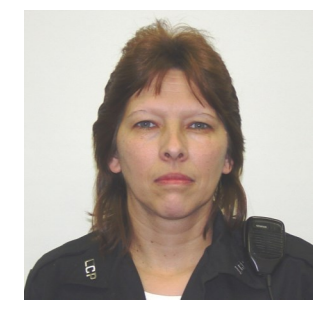
Retired on 4/15/16 after 19 years of service with the County